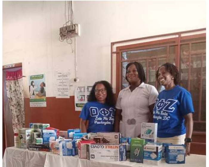
Medical Supplies were donated to Adukrom Clinic