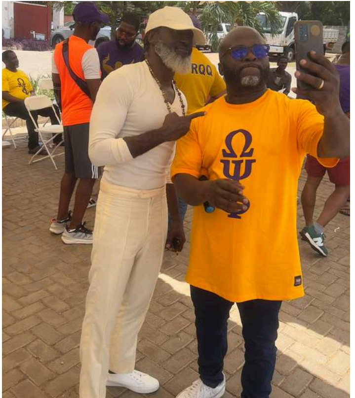
Annual Easter Health Fair at La Nkwatanang Municipiipal Assemlly