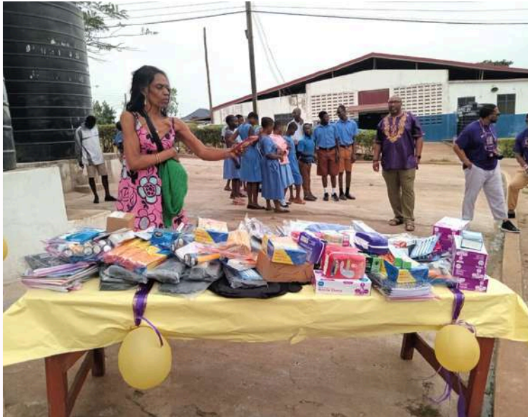
School Supplies were donated to the Akropong School for the Blind