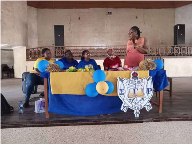
Donation of Echo Pads to Agree Memorial Senior High School in the Central Region, enhancing the students' learning experience.