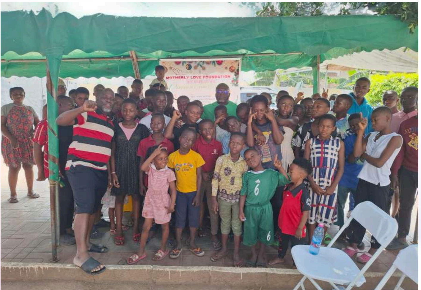
Food Donations to Motherly Love HIV Orphanage Home in Greater Accra, ensuring that the children at the orphanage receive the nourishment they need.